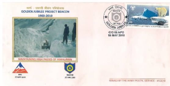
19: Project Beacon Golden Jubilee