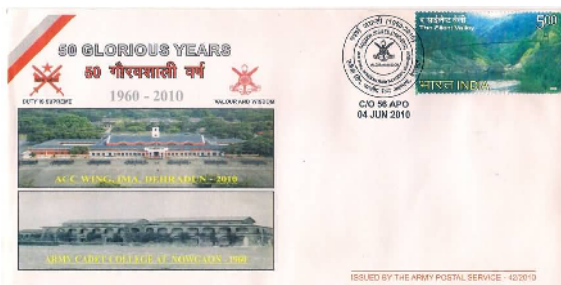
04: Army Cadet College Wing, Indian Military Academy, Golden Jubilee