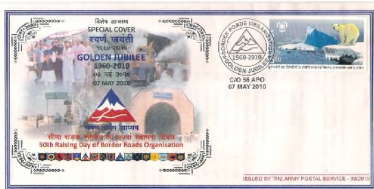
07: Border Roads Organization Golden Jubilee