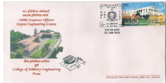
23: 100th Engineer Officers Degree Course, College of Military Engineering Pune